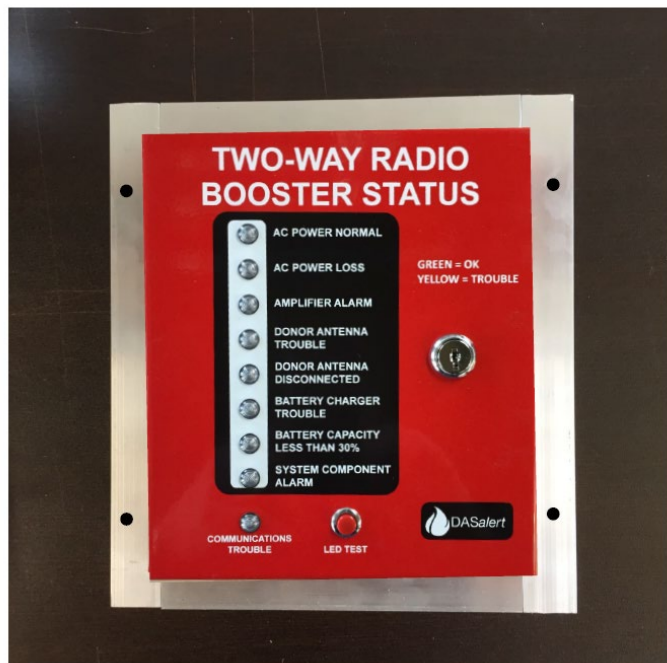
In-wall Flush Mounting Surround Kit

All alarms from DAS equipment can be delivered to Fire Alarm Panel and Annunciator panel in fire command center on a single CAT 5/6 run up to 5000 ft.