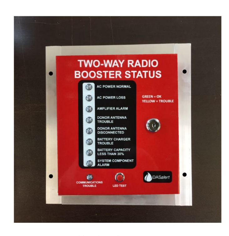
In-wall Flush Mounting Surround Kit

All alarms from DAS equipment can be delivered to Fire Alarm Panel and Annunciator panel in fire command center on a single CAT 5/6 run up to 5000 ft.